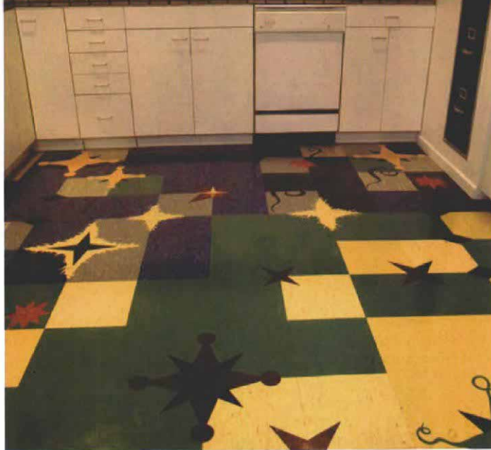
Vinyl tile need not be dull. With white cabinets and gray counters, this Santa Monica kitchen was short on color. A boldly patterned floor, cut from a dozen colors of vinyl composition tile, attacks the monotony.

Linoleum comes in thicknesses ranging from 2mm (optimum residential thickness) to 3.5mm, in 2m wide rolls and 12in. square and 20in. square tiles. Installations can be simple one-color or two-color affairs, or with the different colors available, complex patterns and designs can be created (bottom photos, facing page). For 2mm thick material in one color, you can expect to pay just over $3 per square foot, plus